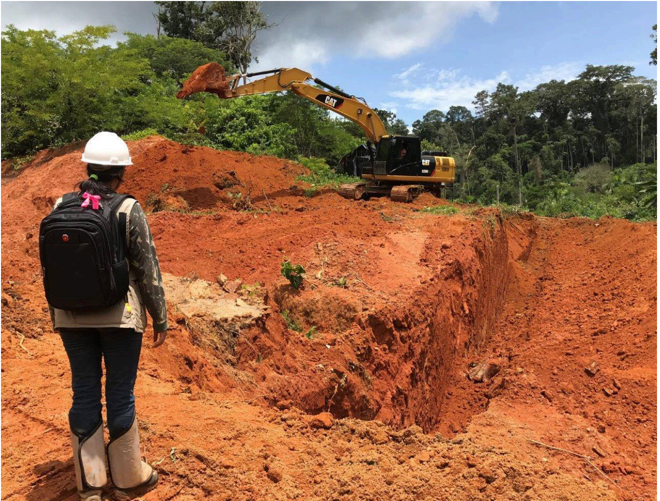
Trench digging in the red South American soil at the Cuiú Cuiú gold district, Tapajos region, Brazil.