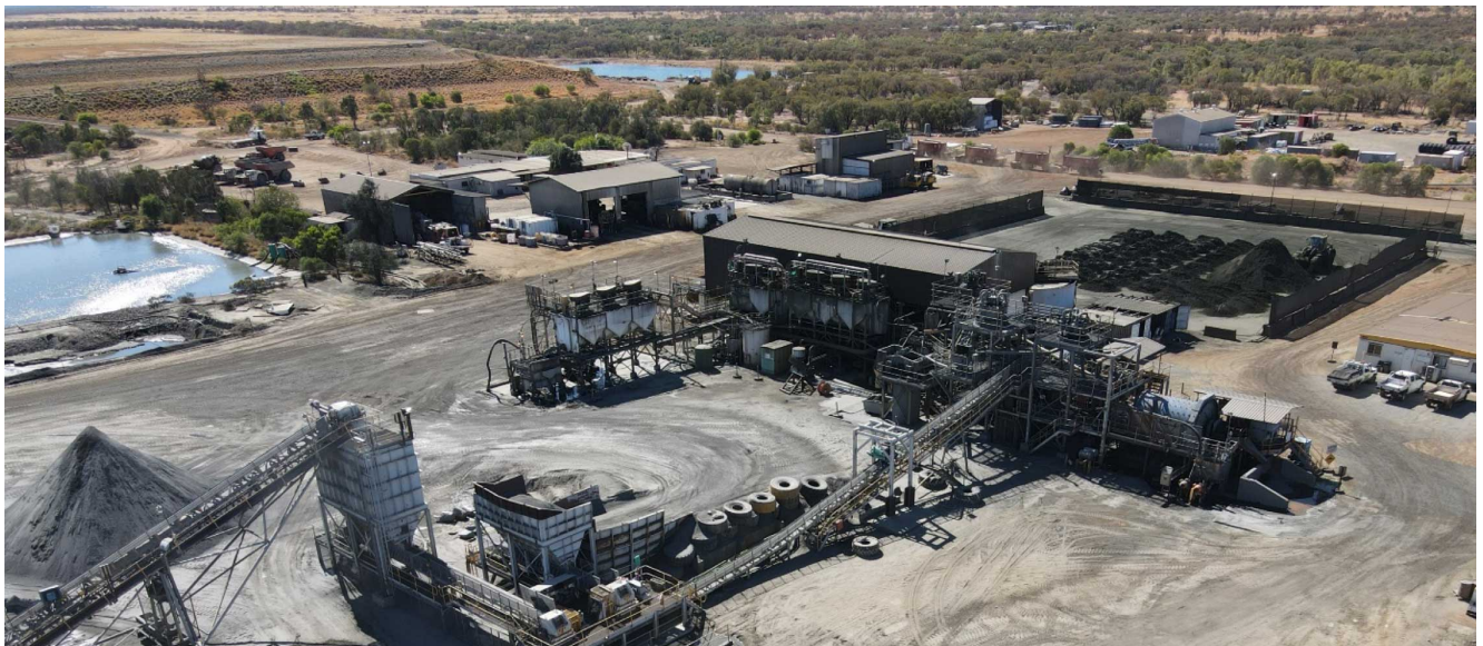
Eloise Copper Mill