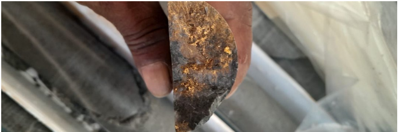
Drill core

Gold production is estimated at 298,000 ounces per annum during years 3 through 10. The OKO gold project will contribute significantly to Guyana's economy.