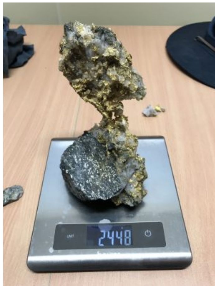
Karora Resources – Beta Hunt Mine Specimen Stone

Announced additional significant results from gold exploration drilling targeting the Fletcher Zone at the Beta Hunt Mine.