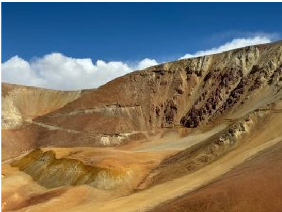
Mogotes Metals Filo Sur vista

Announced that four drill rigs are currently drilling multiple porphyry and epithermal targets at the Company's Mogotes Filo Sur project, that adjoins the southern limit of the large BHP / Lundin Filo Del Sol Copper-Gold-Silver resource in the Vicuña district.