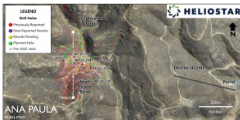
Ana Paula drill map

The program aims to convert inferred ounces to higher confidence classifications. The highlight was 69.15 m grading 10.09 g/t from 93.0 m.