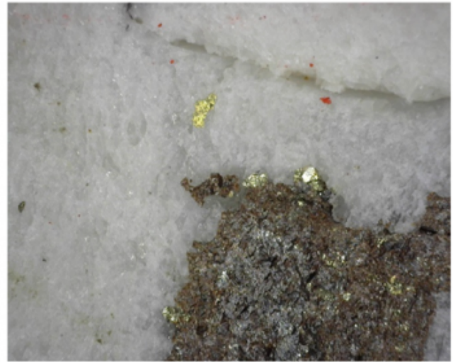
B) AX-22-206: 30.3 m to 30.9 m – 7.04 g/t Au over 0.6 m