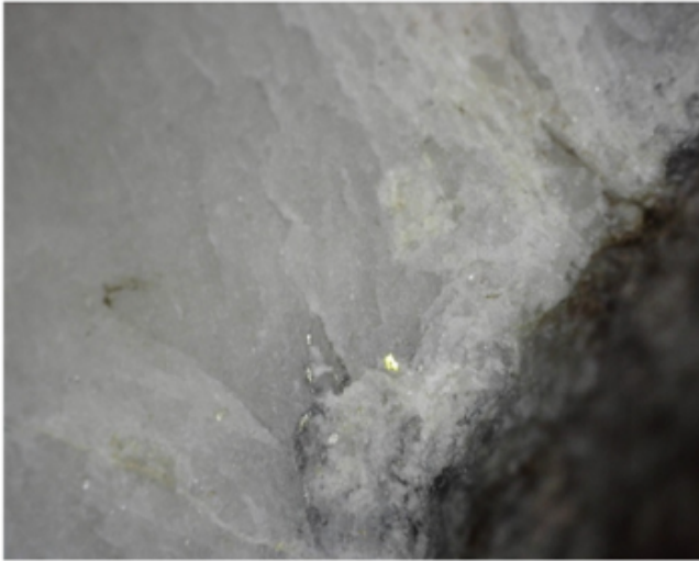
A) AX-22-205: 89.2 m to 89.8 m – 0.66 g/t Au over 0.6 m