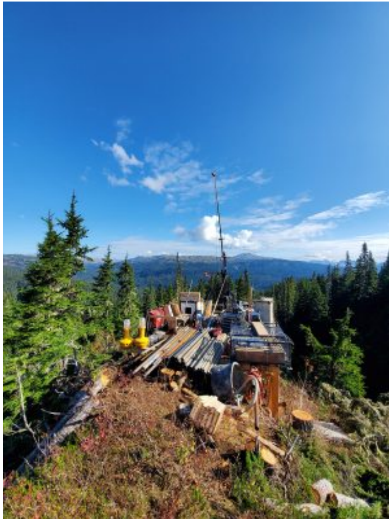
Skeena Resources – Eskay Creek drilling, Golden Triangle, B.C. Canada.

In come Japan Gold, Skeena Resources, Tristar Gold, plus early stage stories Auteco Minerals and Barton Gold.