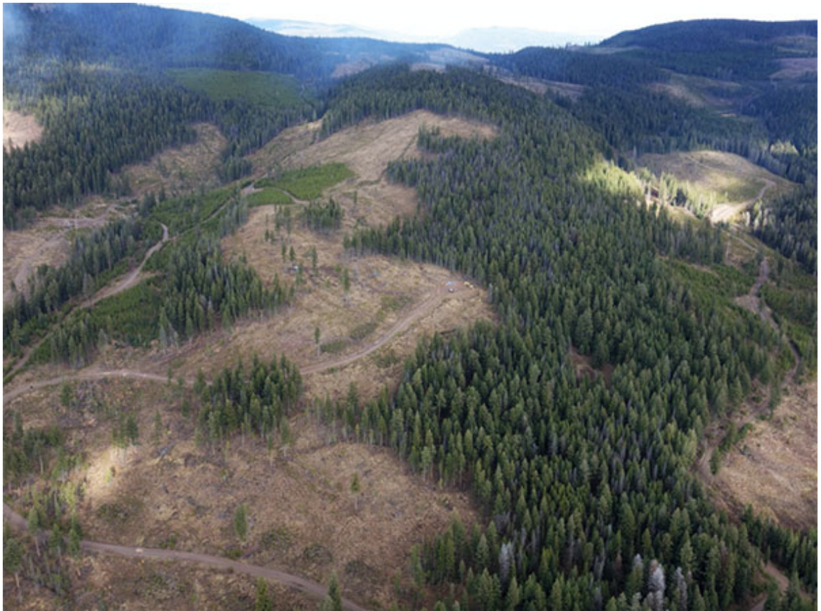
Westhaven Gold – Shovelnose Mountain vista, near Merritt, B.C.

Provided an exploration update on its 17,623-hectare Shovelnose gold property. Shovelnose is located within the prospective Spences Bridge Gold Belt, which borders the Coquihalla Highway 30 kilometres south of Merritt, British Columbia.