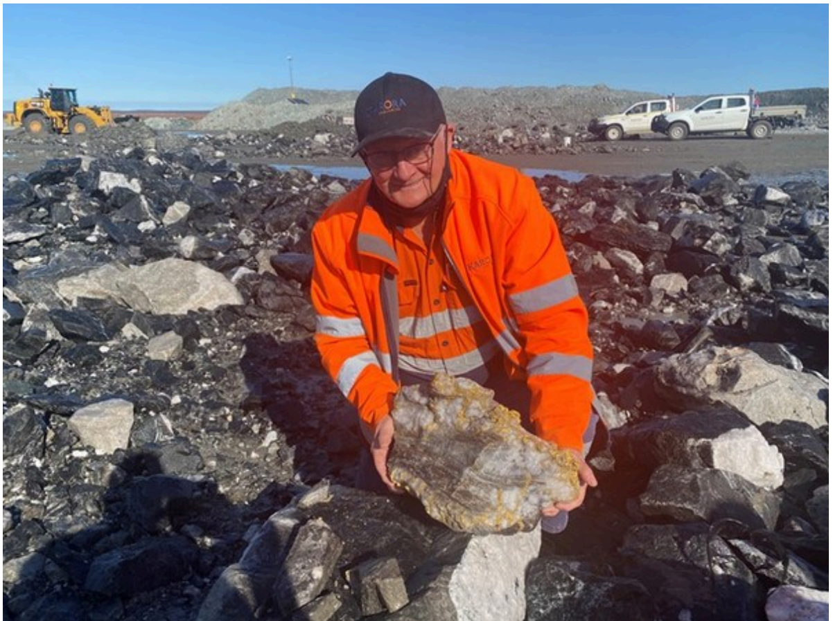
Karora Resources Inc–Karora Discovers New High-Grade Coarse Gold

“As we have stated in the past, coarse gold occurrences at Beta Hunt are best described as periodic upside to mine production. We will not lose our focus on following a disciplined mine plan and controlling costs.”