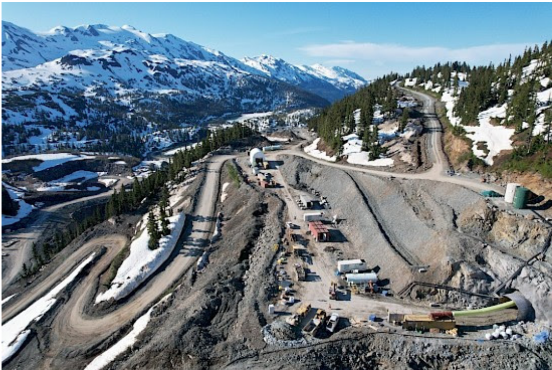
Ascot Resources – Big Missouri portal

As of Q1 2023, detailed engineering stands at 99% complete, major procurement is over 95% complete, and project construction excluding mine development is at 35%.