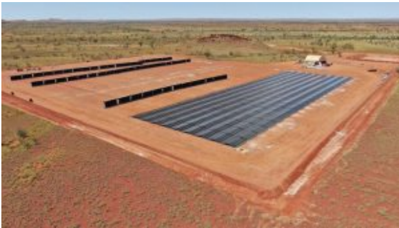
Calidus Resources new solar and battery farm at the Warrawoona Gold Mine, WA.

Calidus Resources and i-80 Gold reported exploration results, Ascot Resources, Colonial Coal, and Wesdome Gold Mines reported Q3 financial results.