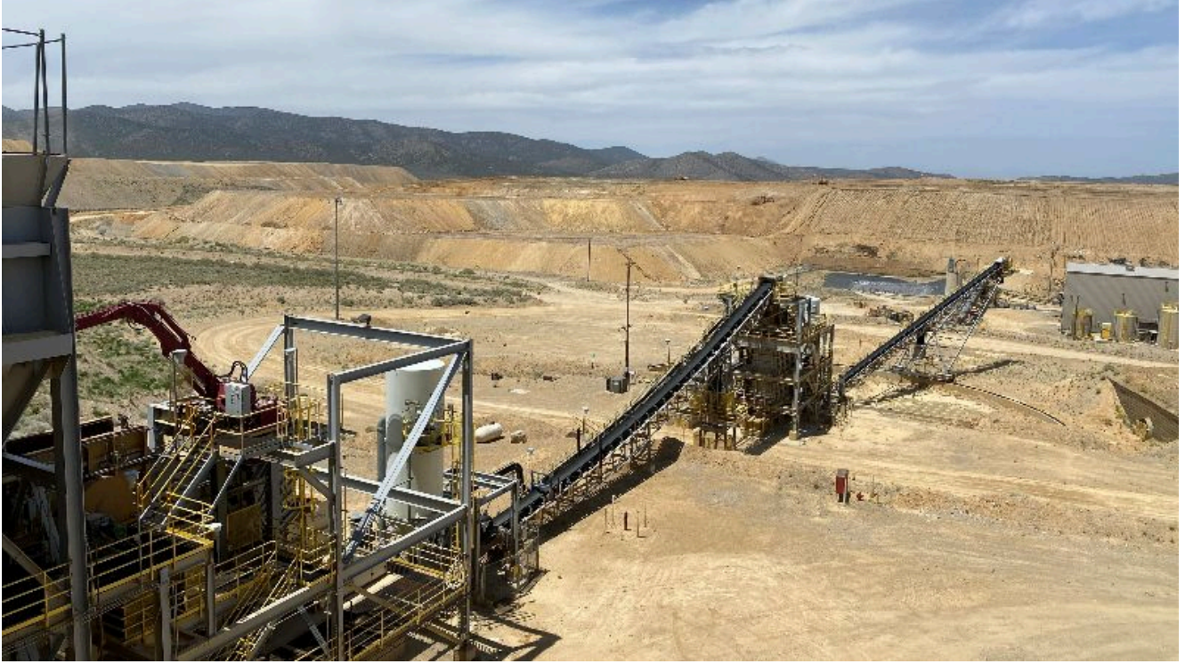
Ruby Hill, Nevada