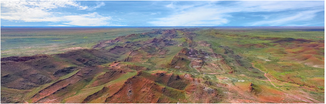
Calidus Resources – Klondyke Prospect panoramic view