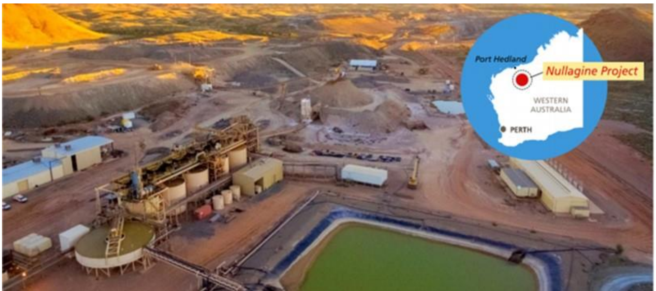
Calidus' Nullagine gold project, Pilbara, WA.

New from our watchlist was dominated by G Mining Ventures and West Red Lake Gold Mines, with two news items each, but others stole the show.