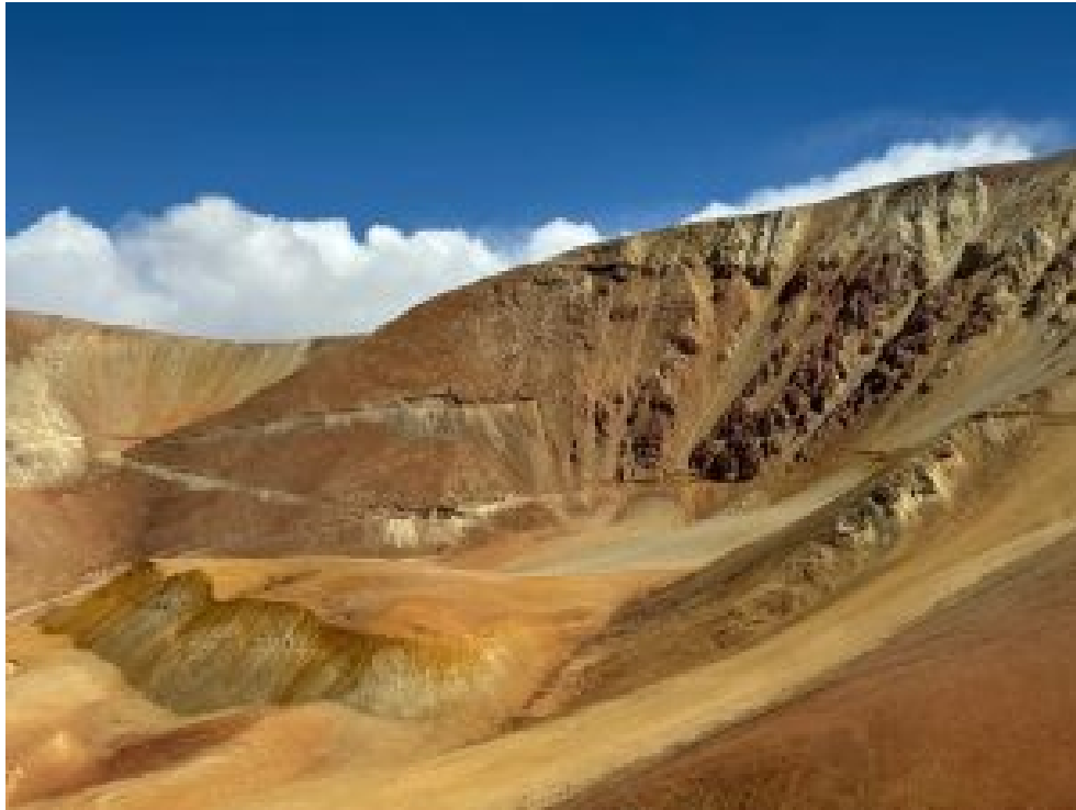
Mogotes Metals Filo Sur vista