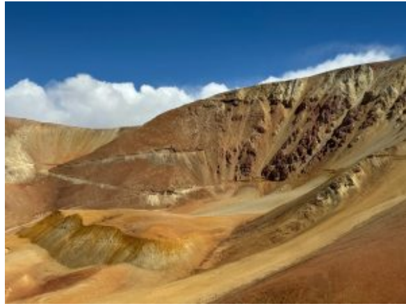
Filo Sur vista