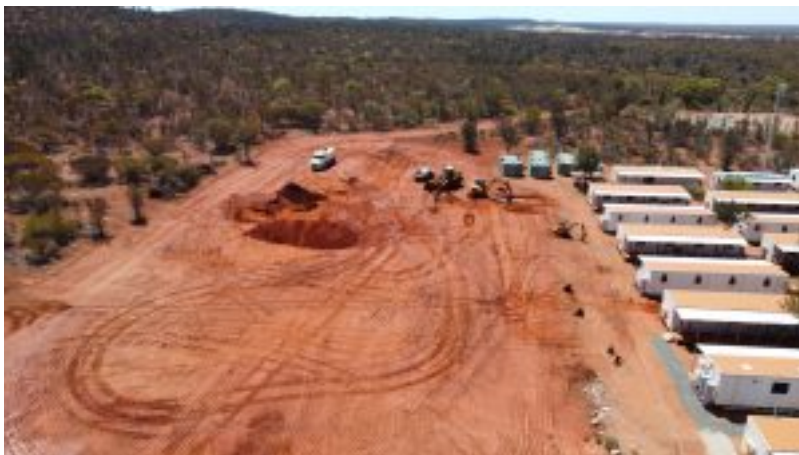
Ora Banda Mining Minesite

Following the initial success of the original Little Gem EIS diamond hole LGDD24001 which identified high grade gold mineralisation (4.7m @ 7.4g/t) Ora Banda has completed a further five-hole diamond program (1,849 metres).