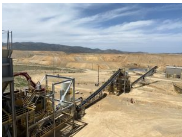
i-80 Gold Ruby Hill Mine, Nevada, USA

Reported results from the first four holes drilled to follow-up the recently discovered Hilltop Zone that have confirmed high-grade, polymetallic CRD mineralization at the Company's 100%-owned Ruby Hill Property located in Eureka County, Nevada.