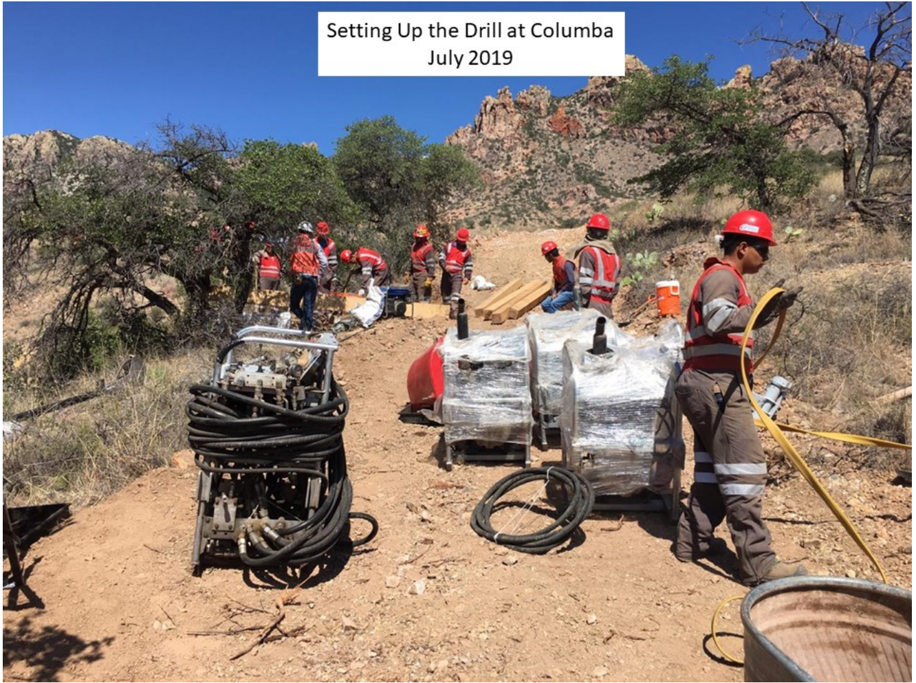
Kootenay Silver Columba drill camp, Mexico.

Setting Up the Drill at Columba July 2019