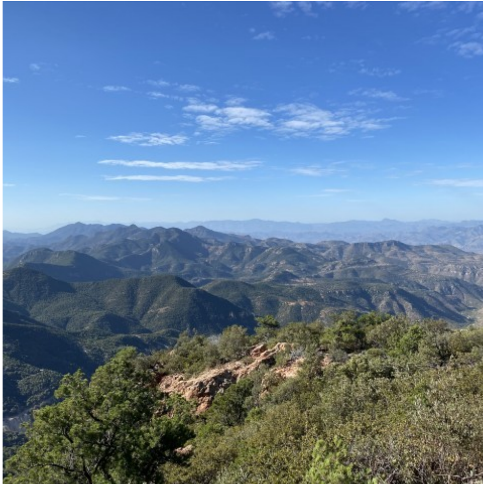
Silver Tiger Metals – El Tigre Mine panoramic view

SILVER TIGER METALS INTERSECTS 2,049 g/t Ag Eq OVER 0.5 METERS ON THE PROTECTORA VEIN AND 1,121 g/t Ag Eq OVER 0.7 METERS ON THE CALEIGH VEIN AT EL TIGRE