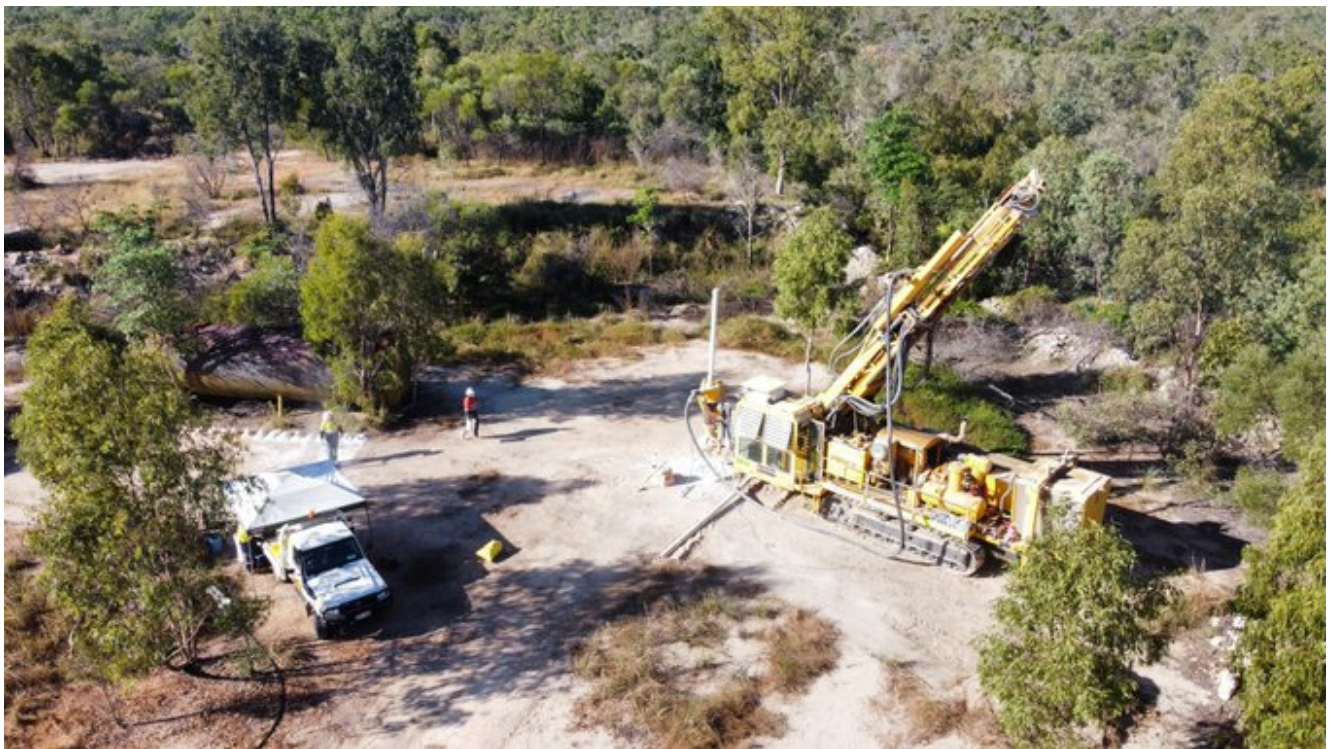
Pacgold Alice River drilling August 2022

Have issued an updated corporate presentation for the recent Noosa Mining Conference in Australia.