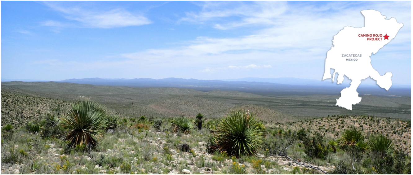
Orla Mining project panoramic view and location map – Zacatecas State, Mexico