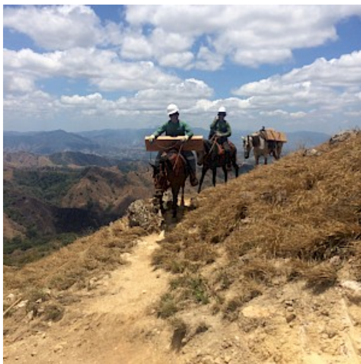
Cerro Quema Project, Panama

comprising the concessions to be a reserve area.