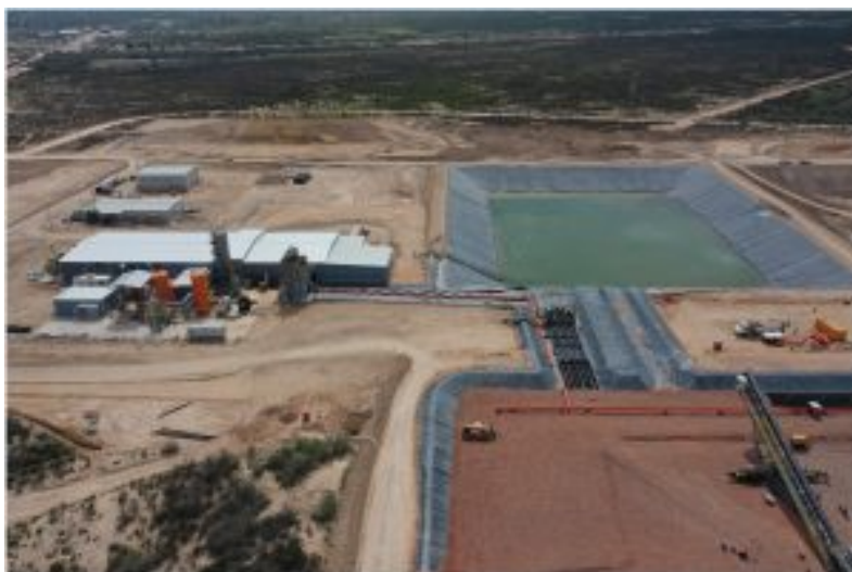
Orla Mining heap leach pad, Solution pond, and Merrill-Crowe plant

In 2023, Orla completed 6,500 metres of drilling near the Camino Rojo Oxide Mine in Mexico to define additional oxide mineralization near the open pit.