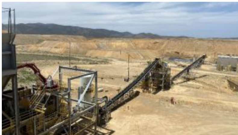
i-80 Gold – Ruby Hill, Nevada

Cabral Gold, i-80 Gold, and Orla Mining all reported strong drilling results this week.