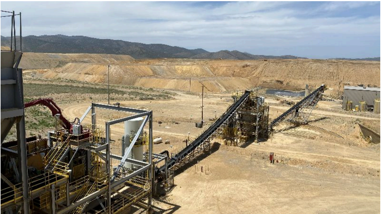
Ruby Hill, Nevada

Impact Minerals, Calidus Resources, i-80 Gold, and Orla Mining all announced significant exploration successes this week.