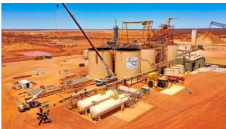
Capricorn Metals Karlawinda Mine

The big news of the week was Karora Resources announcing a merger with ASX listed Westgold. Capricorn Metals and Orla Mining reported strong starts to 2024.