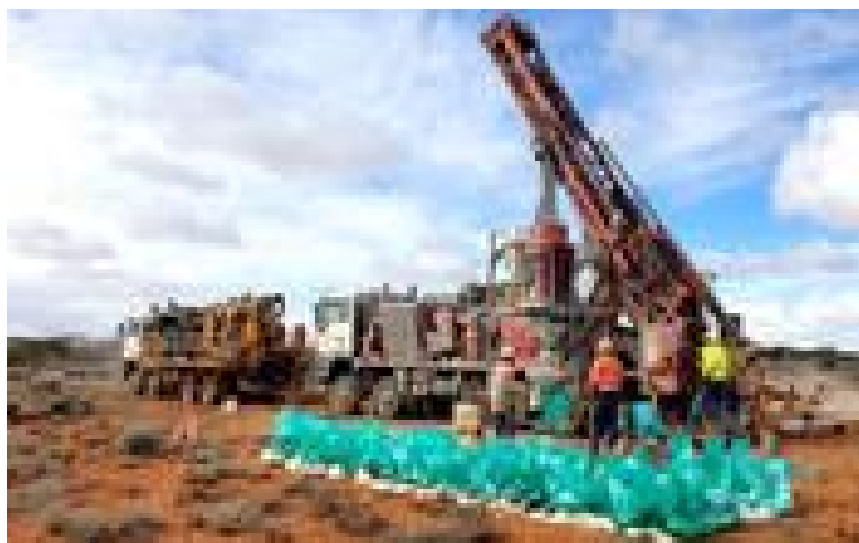
Tolmer Silver drilling – Credits Bartom Gold

~380 samples have been collected with assay results expected during September 2025.