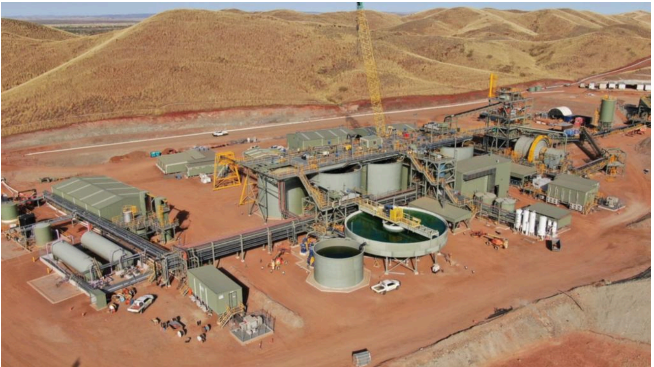
Calidus Resources Warrawoona mine

A transition to care and maintenance for the Warrawoona Gold Mine will be undertaken over a period of three weeks, pursuant to a detailed plan to ensure that value is preserved in all of the Group's fixed assets.