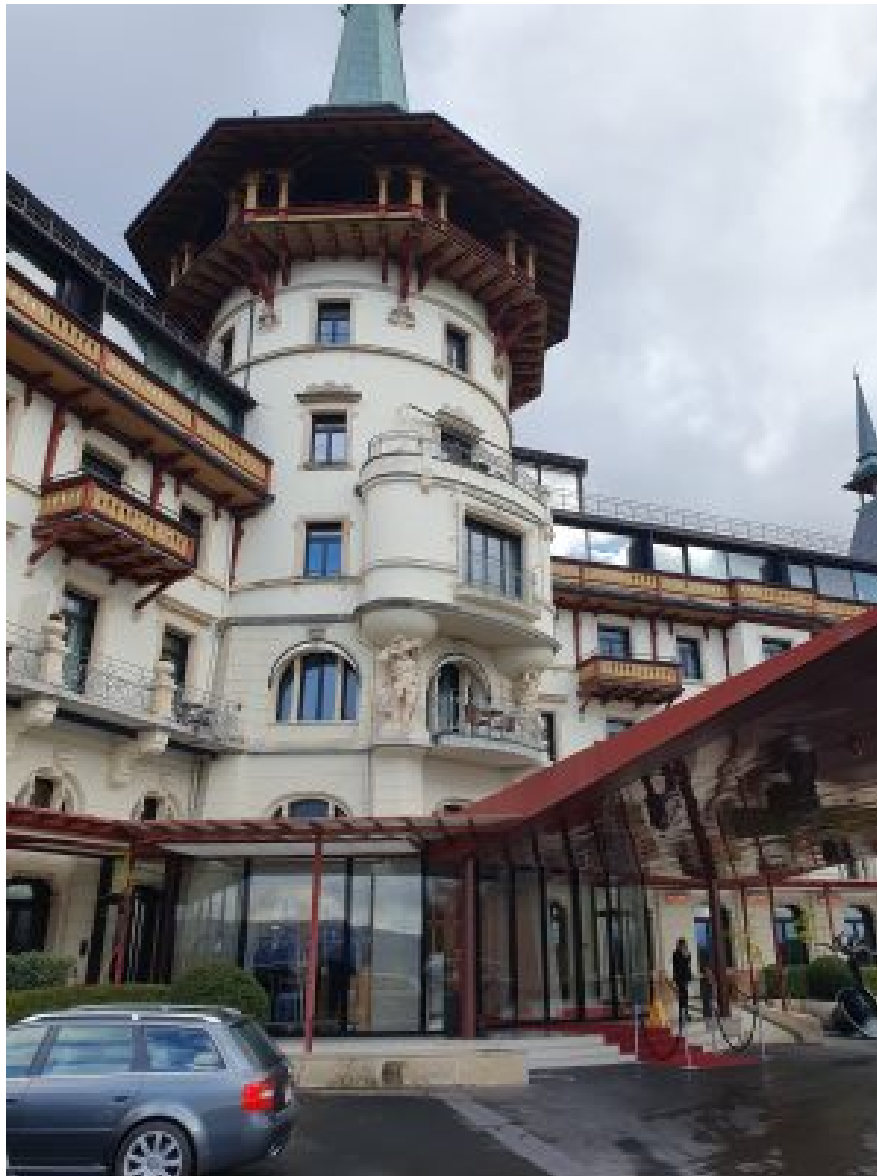
The magnificent Dolder Grand Hotel, Zurich