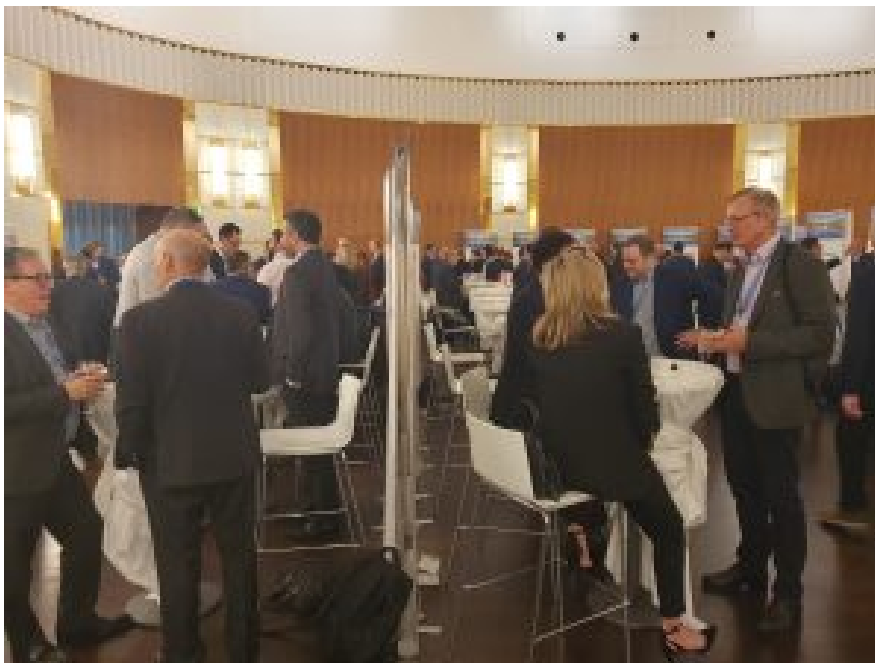
Booths were especially busy in the afternoon.